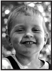
As a Little Kid